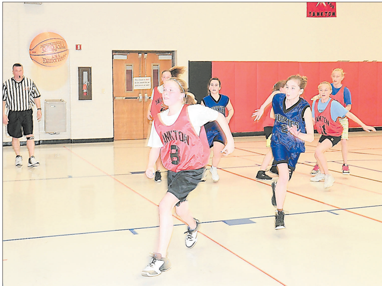
A Yankton Waterfront player chases down a rebound during their sixth grade girls' white division game against Elk Point-Jefferson Friday at Yankton Middle School.