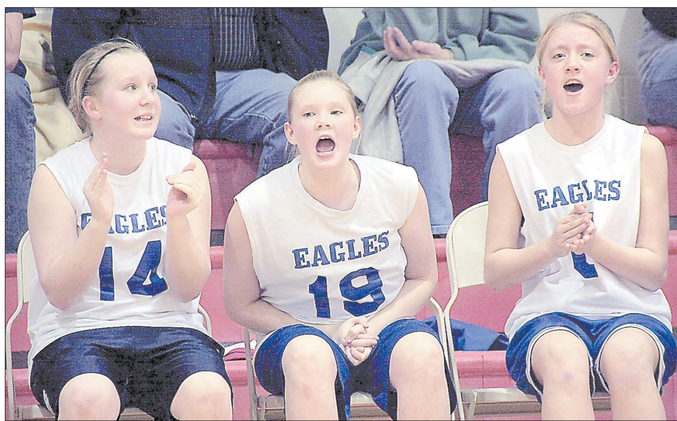
Members of the Irene-Wakonda Eagles get caught up in the excitement of their team's opening round game against Yankton Rexall in sixth grade girls red division action at the Yankton Middle School. Yankton Rexall won the game 23-19 in double overtime.