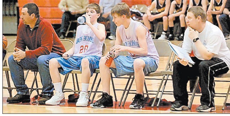
Bon Homme players take a break during their eighth grade boys' red division game with Madison Friday at the Summit Center.