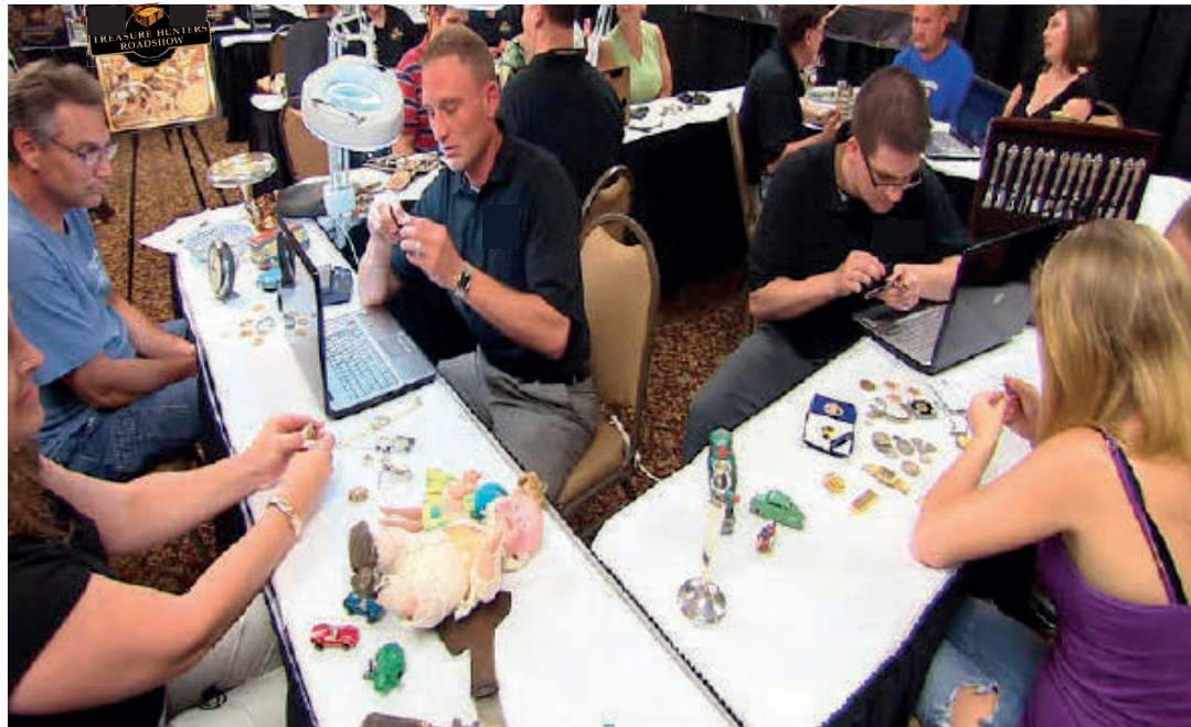
Above • Clean out those attics, basements and lock boxes and get ready to CASH IN.