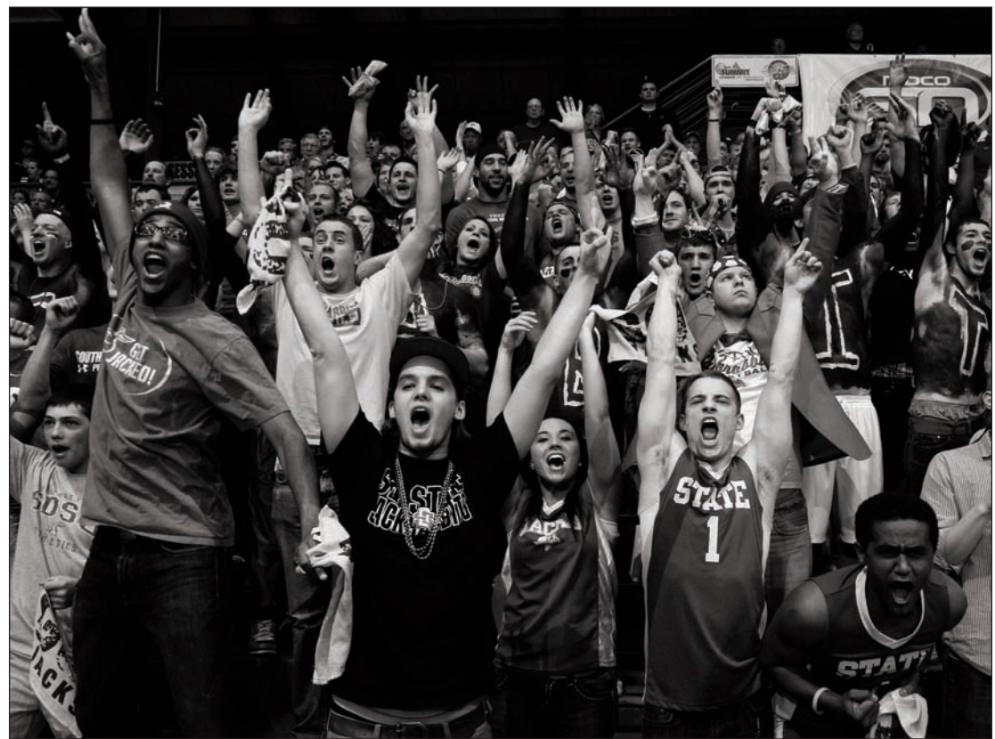
South Dakota State fans celebrate during the Summit League Tournament last week in Sioux Falls. The Jackrabbits earned the program's first-ever NCAA Men's Basketball Tournament berth, and will face Baylor tonight (Thursday) at 6:27 p.m.