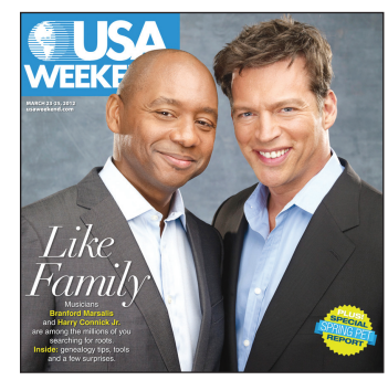
Tips For Searching For Family Roots