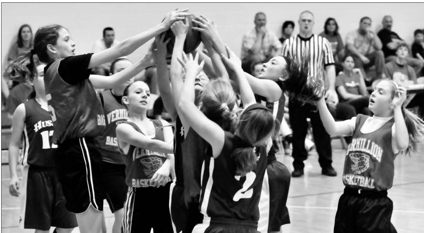
A sea of hands surrounds the basketball during a sixth grade girls' blue division game between Vermillion and the B-E Huskies at Yankton Middle School.