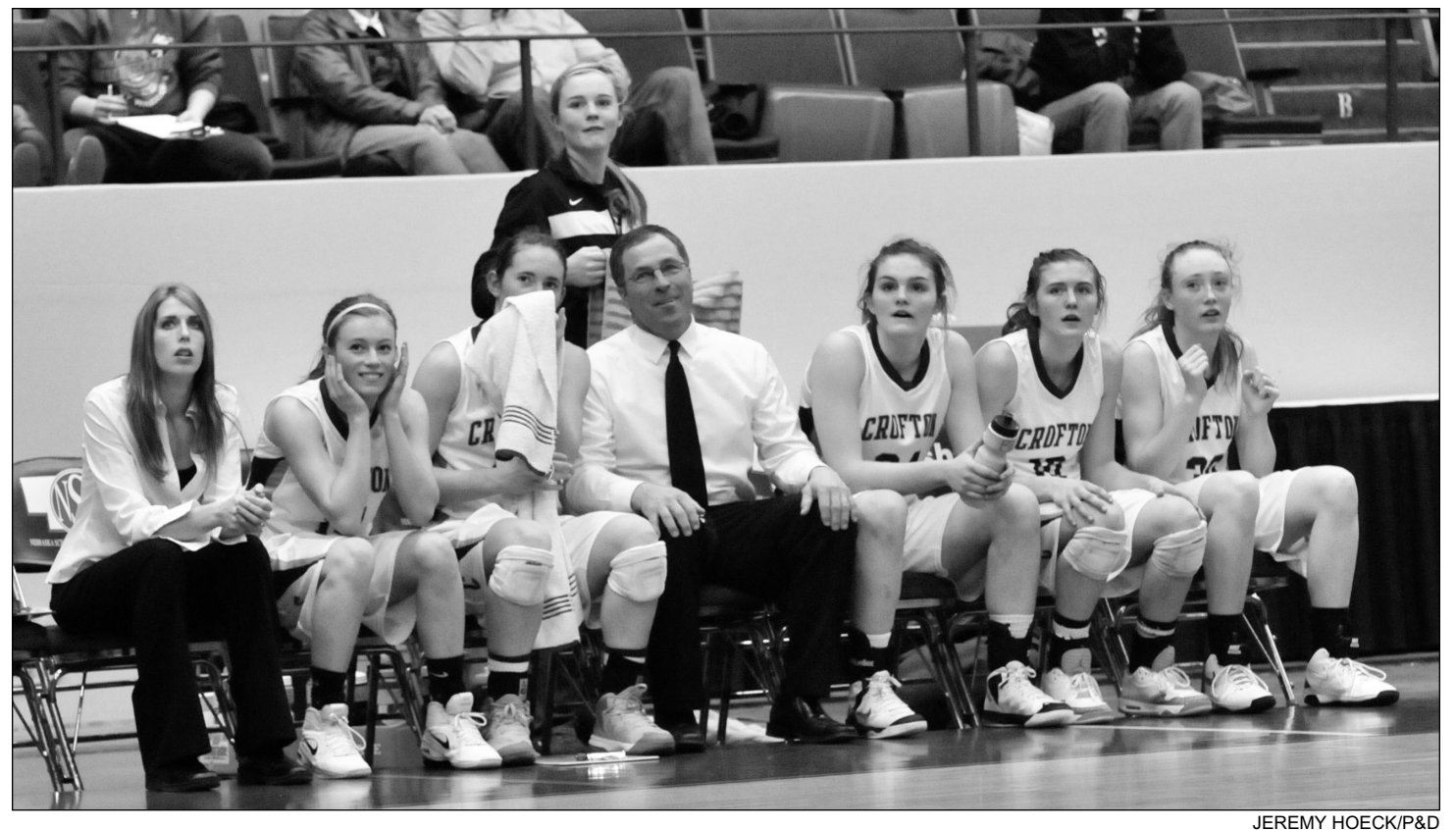
The Crofton Lady Warriors' bench watches the final shot attempt hit off the rim in the closing seconds of Friday morning's Class C2 semifinal win over Homer at the Nebraska State Girls Basketball Tournament in Lincoln, Neb.