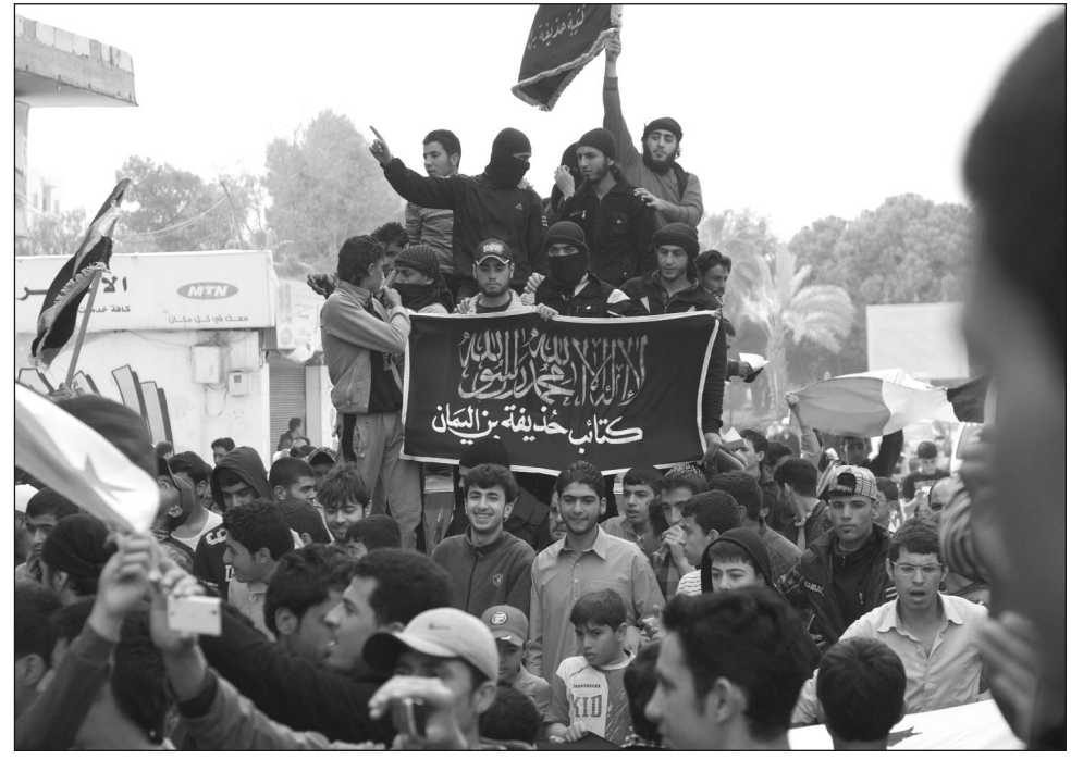
Anti-government demonstrators rally in Raqqa, Syria, on Friday. In early March, Raqqa become the largest Syrian city to fall under rebel control.

"All that has happened to the Syrian peo-