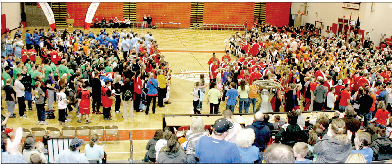
A large crowd was on hand at the Summit Activities Center earlier this month for the opening ceremony of the 2013 South Dakota State Special Olympics Basketball Tournament. After a successful three-year run in Yankton, the tournament will move to Pierre starting next year.