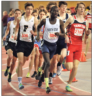
Area Teams Compete At Dan Lennon • 7