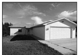
89382 Hwy. 121 • Crofton $86,500

810 2nd St., Scotland, SD 3-bedroom, 1-bath. Extra large lot with garage. $23,500 (605)789-0814.