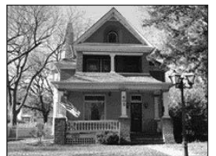
405 Pine • $149,900

3-Bedroom, 1-Bath, VERY nicely redone! Jolene, Century 21 (605)464-9634