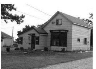
1208 Main St Tyndall Price Reduced $75,500

3-Bedroom, 1-Bath, VERY nicely redone! Jolene, Century 21 (605)464-9634