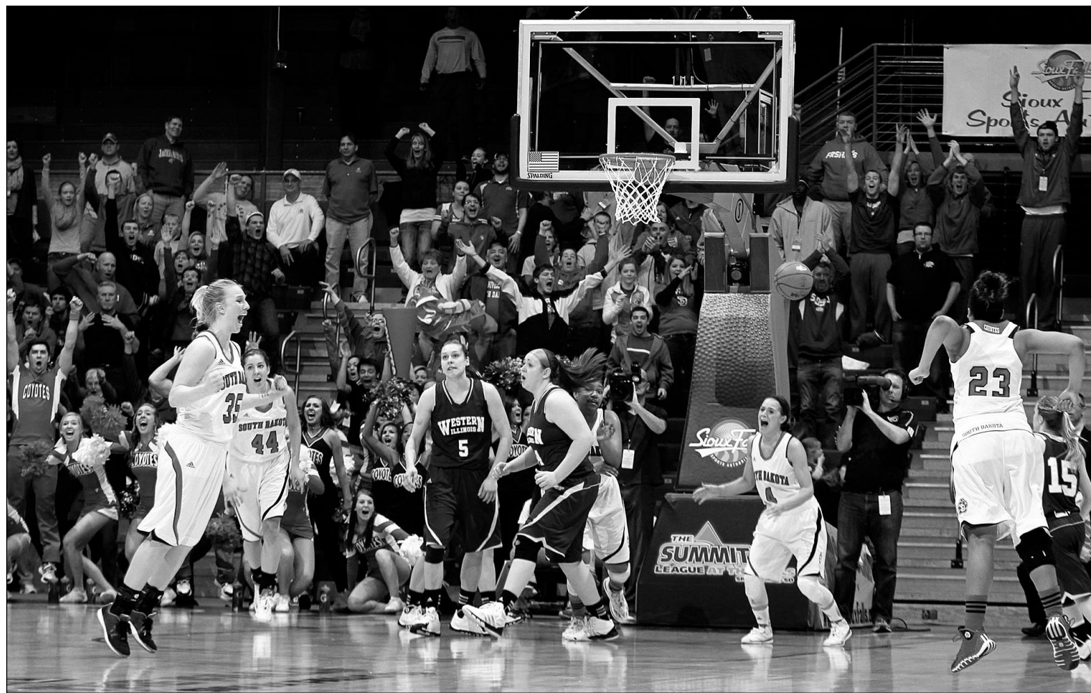
The University of South Dakota celebrates their game winning basket with 1.1 seconds left to defeat Western Illinois 96-94 in their semifinal game at the 2014 Summit League Tournament on Sunday in Sioux Falls.