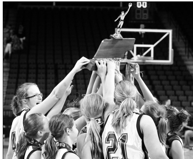
The Wynot Blue Devils hoist their Class D2 championship trophy after a Saturday night win over Sterling at the Nebraska State Girls' Basketball Tournament at Pinnacle Bank Arena in Lincoln, Neb. Wynot beat the Jets 55-38 to claim the program's fourth consecutive state championship.