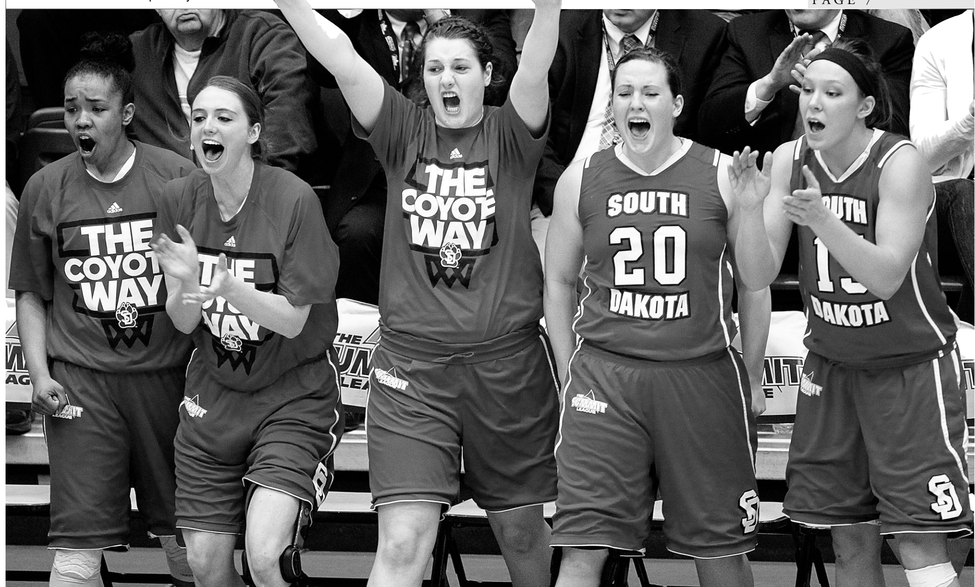
Players on the South Dakota bench celebrate a basket late against South Dakota State during their 72-58 semifinal victory at the 2014 Summit League Basketball Championships at the Sioux Falls Arena Monday, USD will face sixth-seeded Denver in the championship, today (Tuesday) at 1 p.m.