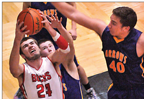
State Bound! Bucks Advance With Win • 8