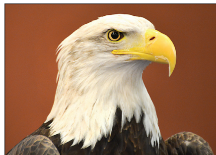
HAVE A PHOTO? Submit it to River City for publication in this space: RiverCity@yankton.net.