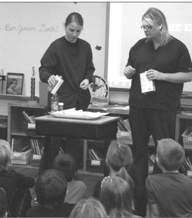
Dental hygienist from Ben Jensen Dental explained the correct way care for teeth to third graders at Stewart Elementary. The dental hygienist's also demonstrated how poor dental care and sugary foods can affect your teeth and cause tooth decay. After the presentation, the students received a toothbrush, toothpaste, and literature regarding the importance of dental health.

VERMILLION — For the sixth year, the University of South Dakota was recognized nationally for outstanding community service by the Corporation for National and Community Service, which named USD to the President's Higher Education Community Service Honor Roll.