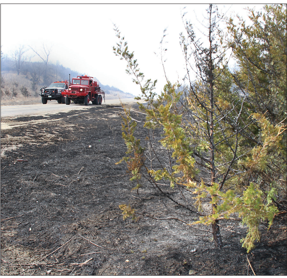
Firefighters from Crofton and Yankton were summoned to a blaze west of the Weigand area near Gavins Point Dam shortly after noon on Friday. A fire that started in a house on the south side of the road spread to the vegetation and eventually pushed north across the highway due to the wind.