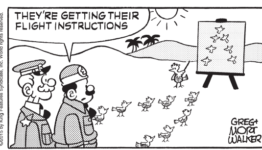
HI AND LOIS