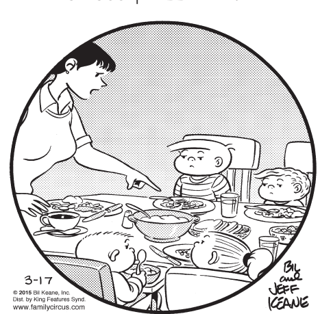
"Sorry, it's St. Patrick's Day — you have to eat all your GREEN vegetables."