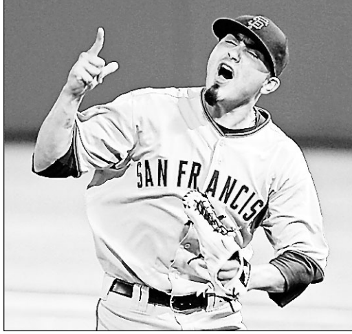
San Francisco Giants pitcher Sergio Romo reacts to getting out of a bases loaded situation in the eighth inning against the Florida Marlins at Sun Life Stadium on Wednesday night in Miami.