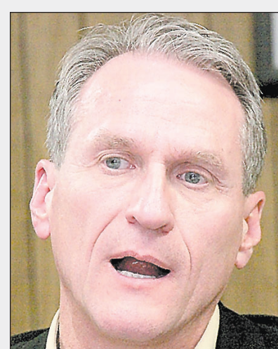
South Dakota Lt. Gov. Dennis Daugaard stopped in Yankton Wednesday as part of his campaign for the Republican nomination for governor.