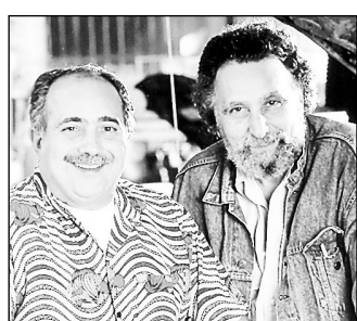
CLICK & CLACK

TOM: During combustion, a bunch of the carbon molecules (C) in the gasoline attach to two oxygen molecules (O) from the air, and come out the tailpipe as