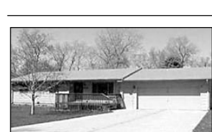
43486 Kaiser Rd.

2-bedroom, 3-bath, townhome with garage located in great neighborhood. 1,100sq.ft. finished living area. Move in condition! Price Reduced $79,900. Call (605)661-5561. For more pictures and information, go to www.yankton.net/2912lakeview6