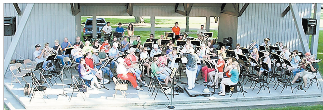
The all-volunteer Yankton Area Summer Band is set for its annual summer concert series each Tuesday night at the Riverside Park amphitheatre through early July. The opening concert of the season is 8 p.m. Tuesday.

The gallery is open from 10 a.m.-5 p.m. Tuesdays-Saturdays.