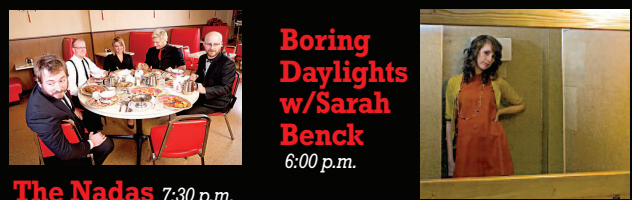
The Nadas 7:30 p.m.