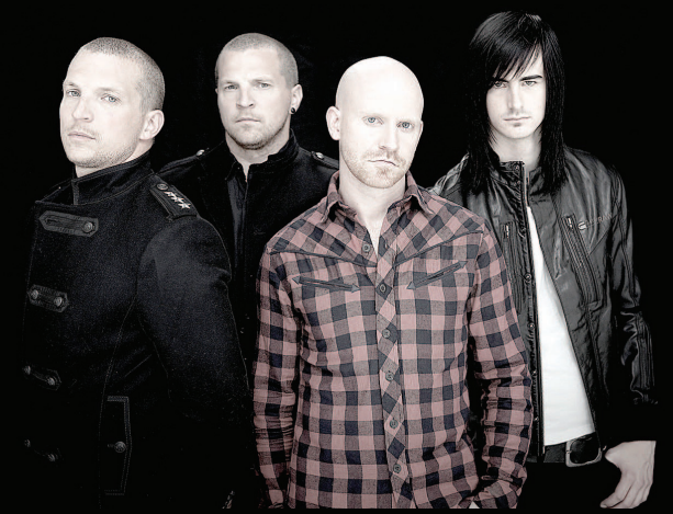
Kory & The Fireflies 7:30 p.m.