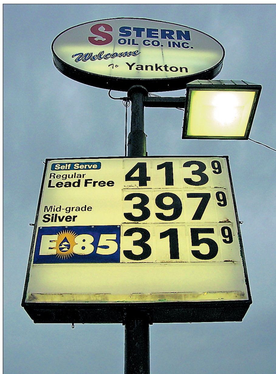
It's a sign of the times, as recent falling gas prices abruptly give way to soaring prices at the pump. Some Yankton locations raised prices 25 cents overnight, sending prices sailing past $4 a gallon.