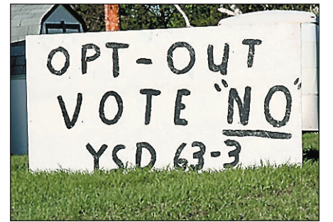
Signs in Yankton have prompted the question, 'Has the 63-3 Foundation chosen to oppose the opt-out?'

The average price of a gallon of regular gas in South Dakota on Wednesday just over $3.92, up more than 20 cents from a month ago and more than a dollar from the same time last year, according to AAA's