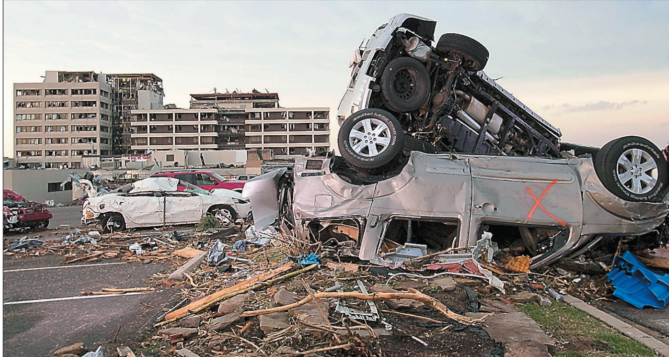
Vehicles were piled on top of each other in the parking lot of St. John's Regional Medical Center Monday after a tornado swept through the heart of the city on Sunday in Joplin, Mo.