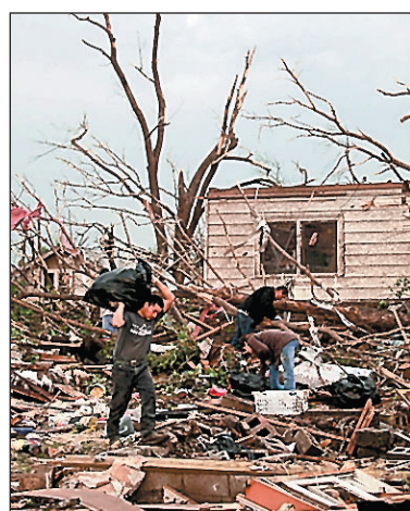
People retrieve their belongings in a home near the St. John's Regional Medical Center in Joplin, Mo., Monday, the day after it was hit by a tornado.