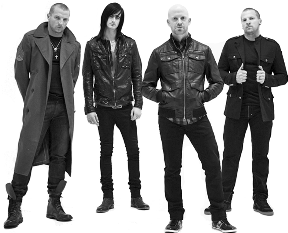
The Grammy-nominated Christian rock band RED is the headliner act on Saturday, June 4, for the Yankton sesquicentennial celebration concert at Memorial Park.