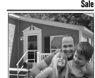
ATTENTION! Thinking of purchasing a