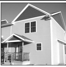
610 Sawgrass St. $145,000

3-bedroom, 2.5 bath townhome. Energy efficient, low maintenance, 1800 sq.ft. of finished living space, 1- car ga-605-661-9931. rage. www.yankton.net/610sawgrass