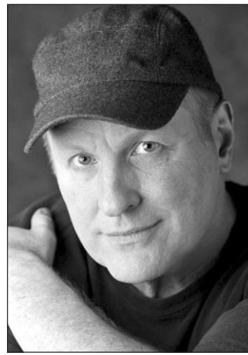
Country music star Collin Raye performs an acoustic concert at the Summit Activities Center theatre in Yankton on Sunday, May 13.

MAY 11 — GRADUATION: Hartington Cedar Catholic MAY 12 — Heartland Humane Society Animal Fair at Riverside Park, Yankton, 10 a.m.-2 p.m. MAY 12 — Mount Marty College spring commencement at Laddie E. Cimpl Arena, Yankton, 2 p.m. MAY 12 — GRADUATION: Alcester-Hudson, 2 p.m.; Armour, 7:30 p.m.; Elk Point-Jefferson, 2 p.m.; Marion; Viborg, 1 p.m. MAY 13 — GRADUATION: Avon, 2 p.m.; Hurley, 2 p.m. MAY 14 — Mothers Day Tea at The Center, 900 Whiting Drive, Yankton, 1 p.m. MAY 16 — Mount Marty College Golf Classic in Yankton. MAY 18 — Techno-Treasure Hunt at the Lewis and Clark Recreation Area, Yankton, 7 p.m. MAY 18-20 — The second annual South Dakota Birding Festival near Fort Randall Dam. For an event schedule and registration form, go to www.sdgreatlakes.org/greatoutdoors/birdinginfo; or call 605-384-3741. MAY 19 — Creatures of the Night Hike at the Chief White Crane Recreation Area, Yankton, 9:30 p.m. For more information, visit www.campsd.com. MAY 19 — GRADUATION: Beresford, 2 p.m.; Bon Homme, 2 p.m.; Freeman, 2 p.m.; Wagner, 1:30 p.m. MAY 20 — GRADUATION: Yankton, 2