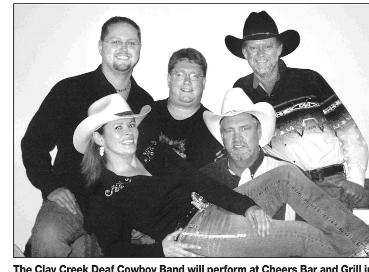
The Clay Creek Deaf Cowboy Band will perform at Cheers Bar and Grill in Yankton this Saturday night.

7:30 p.m. MAY 15 — The Black Keys at the Target Center, Minneapolis, Minn. Tickets: Call (800) 745-3000 or