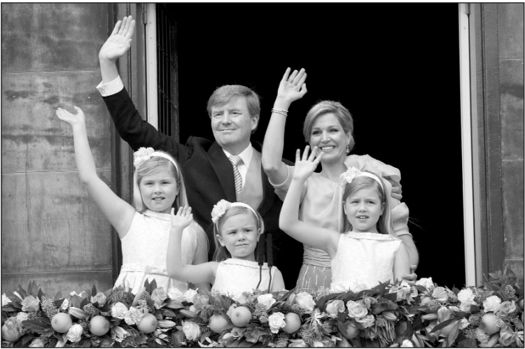
New Dutch King Willem-Alexander, top left, Queen Maxima and their daughters Crown Princess Amalia, from foreground left, Princess Ariane and Princess Alexia wave from the balcony of the Royal Palace at the Dam Square Tuesday in Amsterdam, The Netherlands.