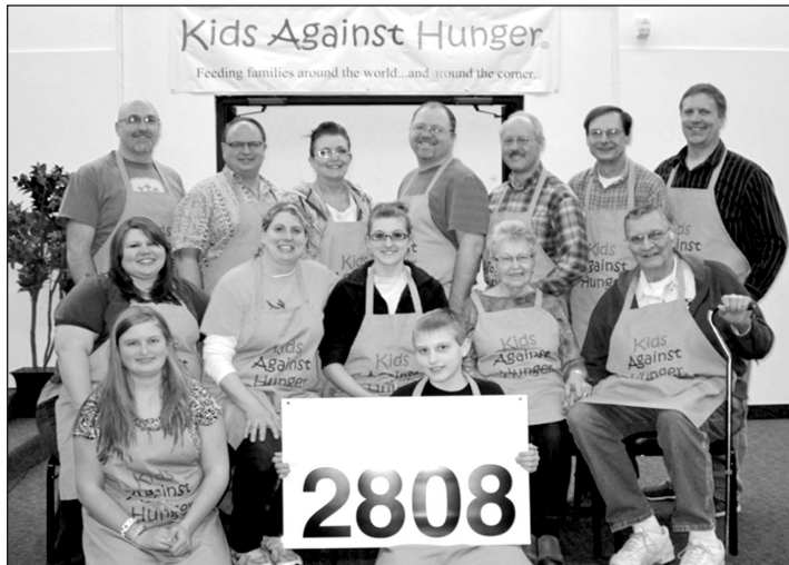
Faith Alive Church recently packed over 2800 meals for children in need of our care at Kids Against Hunger. If your church or youth group would like to learn more about how you can make a difference, please visit www.kahyankton.org .