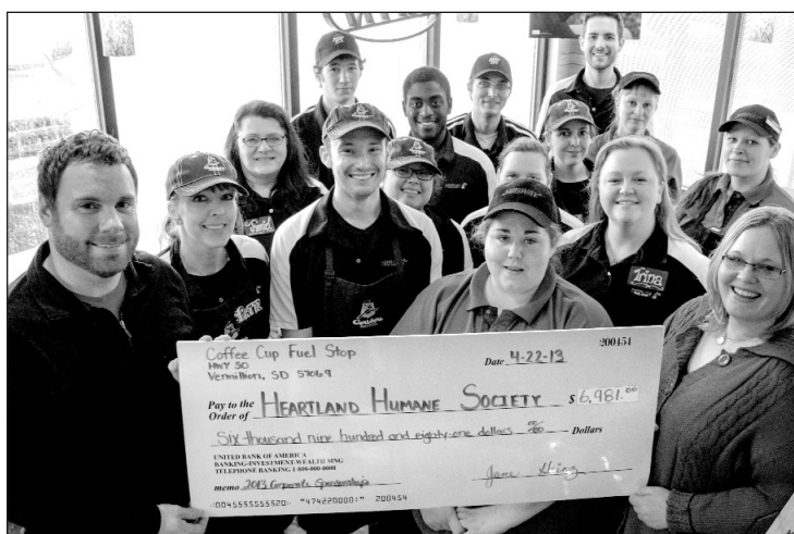
SUBMITTED PHOTO Employees from Coffee Cup Fuel Stop and the Heinz Corporation presented the Heartland Humane Society with a check of nearly $7,000 on April 22, making them the shelter's 2013 corporate sponsor.

Three quarters of the funds are donated tips from the team employees in Caribou Coffee, Subway and Pizza Hut. Upon opening the new facilities in Coffee Cup in October, 2011, the em-