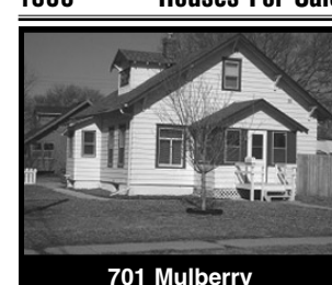
701 Mulberry $77,900

Move in ready, 2-bedroom ranch with new ceramic tile in bathroom and kitchen. Granite countertops, newer plumbing new furnace. (605)660-0618 Bill Conkling, Lewis & Clark Realty.