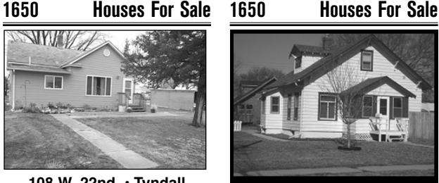
108 W. 22nd · Tyndall $59.500

Yankton Downtown 665-7432 · 225 Cedar Street Yankton North 665-4999 · 2105 Broadway Avenue