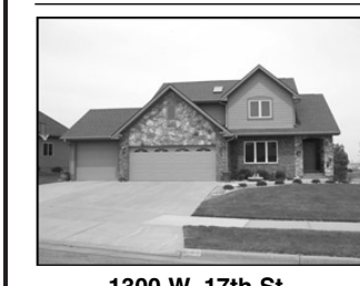
1300 W. 17th St. $339,000

1-1/2-story, 5-bedrooms, 3-1/2 baths, 3-car garage, many updates, corner lot in Summit Heights. (605)661-1799 for viewing or more information http://www.yankton.net/app/ht ml/1300w17th/