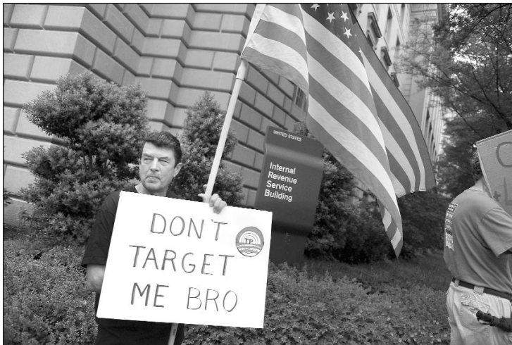
Tea Party supporters rally in front of the IRS building Tuesday in Washington, D.C., to protest the abuse of power from the IRS in targeting tea party and grassroots organizations for harassment.