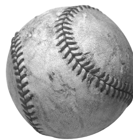
The Yankton Morning Optimists host the annual exhibition baseball game between the Sioux Falls Canaries and the Sioux City Explorers at 6 p.m. Monday at Riverside Baseball Stadium.