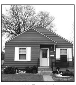
212 East 15th $88.900

1801 West St. Now building 4-bedroom home with triple garage in Summit Heights. Call JW Tramp Construction for information. (605)661-2191