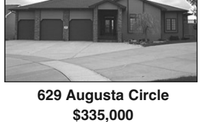
629 Augusta Circle $335,000

2-bedrooms, 1-bath, detached 1-car garage. Kelly Filipis, America's Best Realty (605)660-0900, kbest@iw.net