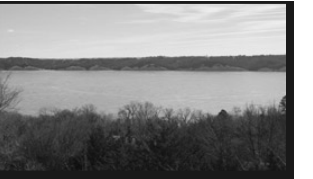
Signal Hill Road • Yankton $169,000

Large corner building lot in Yankton. Corner of West 14th and Jackson St. $18,000. (605)661-4987.