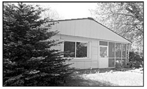
611 James • Wynot • $35,000

3-bedroom, 1-3/4 bath, oversized garage, Emma Century 21 (605)661-2224.