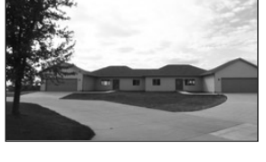
Beautiful Townhome 631 Sawgrass, #2 On Fox Run Golf Course (605)260-5080 or view at www.yanktontownhomes.com