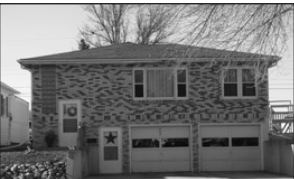
905 West 8th St. • $134,900

3-bedroom, 1-3/4 bath, 1-single car garage, 1-single car garage & large workshop. Large yard & sprinkler system. Updates throughout house. (605)661-7376, http://www.yankton.net/app/ht/ml/810park/