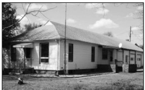
508 Meckling • Gayville $79,900

3-bedroom, 1-3/4 bath, oversized garage, Emma Century 21 (605)661-2224.