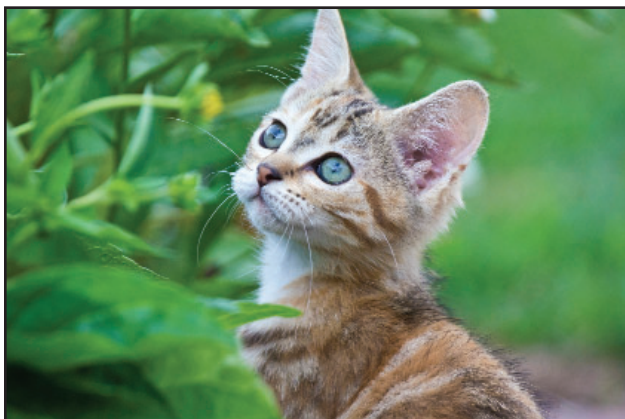
Experiment with different deterrents to keep cats out of garden beds.

surprise or startle the cats. Motion detectors that trigger lights or a sprinkler system can startle cats and keep them away from your garden.