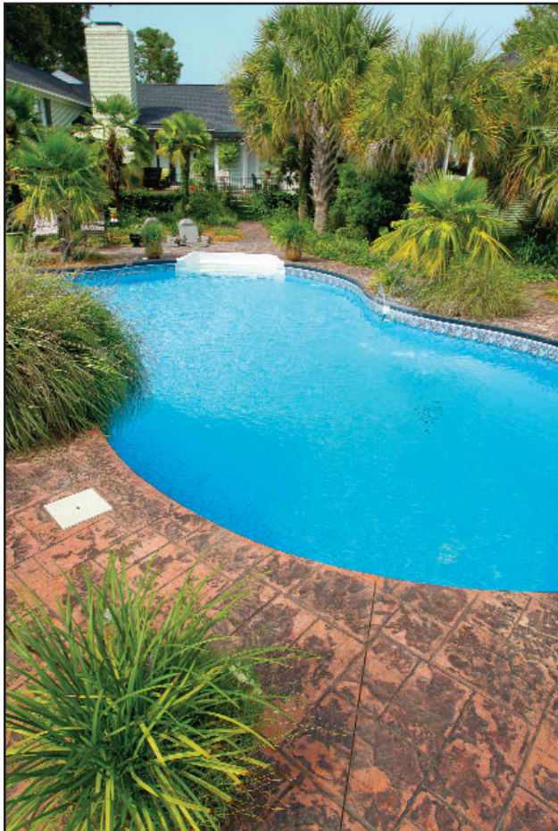
Installation of a pool may require the removal of trees. Larger trees are best removed by a professional.

When a tree is being removed, most of the branches will be removed to make the tree more manageable. Trees are rarely chopped at the base and allowed to fall, as there simply isn't enough room to safely take this approach. Sections of the tree will be cut, roped off and slowly lowered. A climber will scale the tree or use a cherry