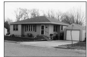
810 Park St. • $163,900

3-Bedroom, 1-bath, large corner lot. America's Best Realty, Kelly Filipis (605)660-0900 kfbest@iw.net