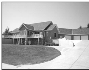
108 Okie Dokie Lane $549,900

http://www.yankton.net/app/ht/ml/100tootys/