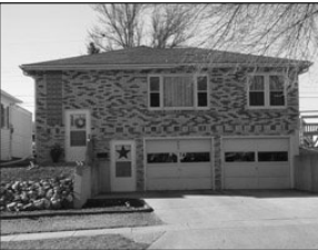
905 West 8th St. • $134,900

2-bedrooms, 1-bath, detached 1-car garage. Kelly Filipis, America's Best Realty (605)660-0900, kfbest@iw.net