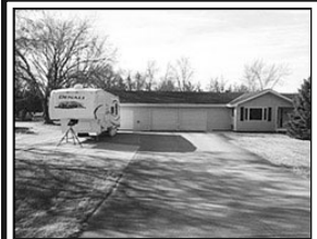
113 Richard (Riverside acres)