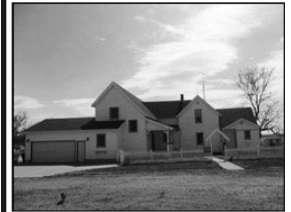
30542 433rd • Utica

3-bedroom, 2-bath, 3-car garage, 1/2 acre lot.