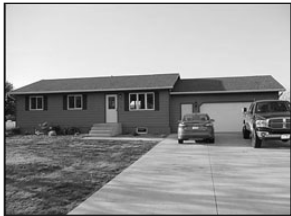
100 Tootys (Riverside Acres) $170,000

3-bedroom, 2-bath, attached 2-car garage. Completely remodeled including finished basement with lots of living space! Kitchen appliances included. (605)661-5737