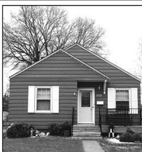
212 East 15th $88,900

2-bedroom, 1-bath, 1-garage, Appliances included. Central location (walk to park, pool and schools). Many updates. Large fenced-in backyard.