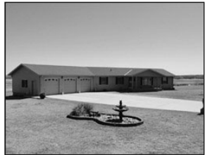
110 Pine • Springfield $224,500

Enjoy the finest lake view! Huge master suite, open floor plan. Lisa, Anderson Realty, (605)661-0054.