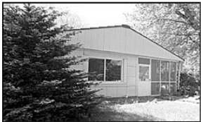
611 James • Wynot • $35,000

http://www.yankton.net/app/ht/ml/212east15th/