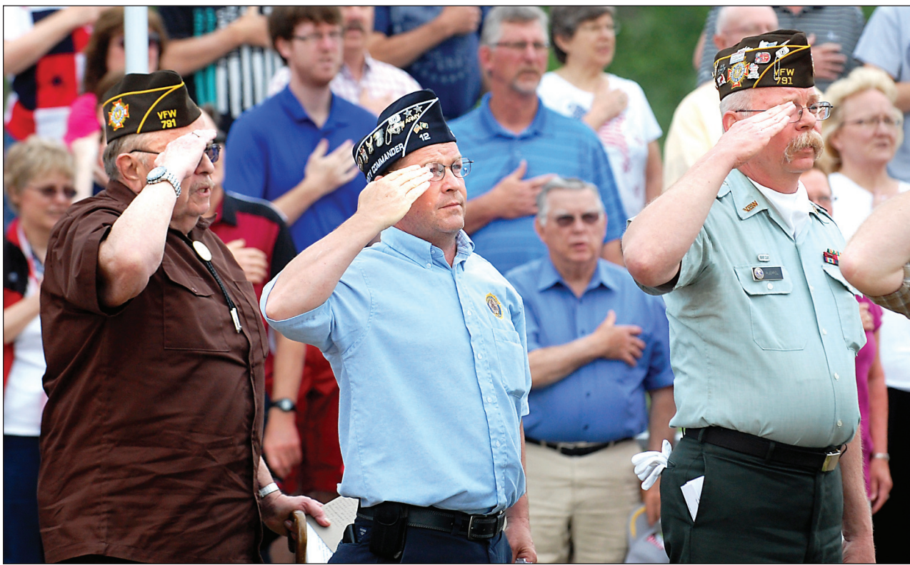
The color guard salutes the flag Monday during the Memorial Day ceremony in Memorial Park. The program featured patriotic messages and a time for remembering veterans, particularly fallen soldiers.