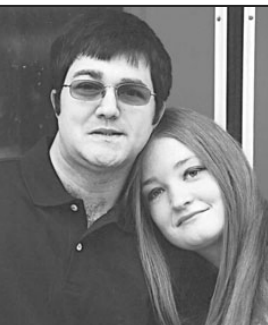
Leise - Homolka

For more information, call the library at 668-5276 — “Bazinga!!”