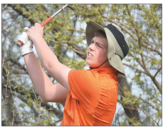
Area Golfers Gear Up For Postseason Action • 13