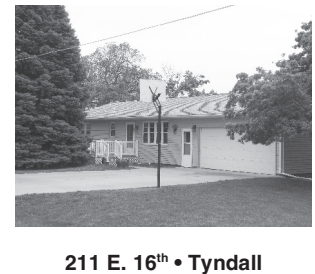
$110,000 3-bedroom, 2-bath ranch,

1704 Mulberry • $114,900 Affordable starter home, great location. Main floor rooms, updated full bath. Partially finished basement, Many updates. Jake 605-661-8899; 605-661-0744. http://www.yankton.net/app/ht ml/1704mulberry