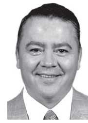
Dr. Wayne KINDLE

Painting of building Carpet replacement in two classrooms Playground structure and safe surface installation Add a basketball hoop on the east playground