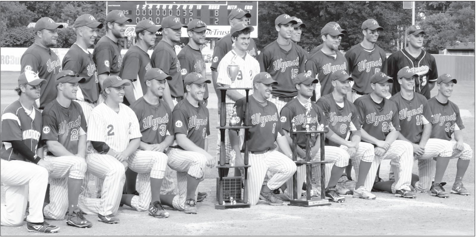
The Wynot Expos capped off a successful 2014 summer with a South Dakota State Class B Amateur Baseball championship. Wynot, and the rest of the South Central League, opens its season Sunday.