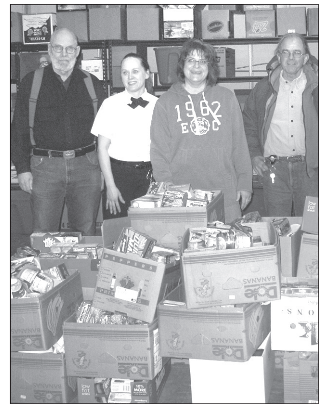
More than 1,600 pounds of food was donated at the UCC