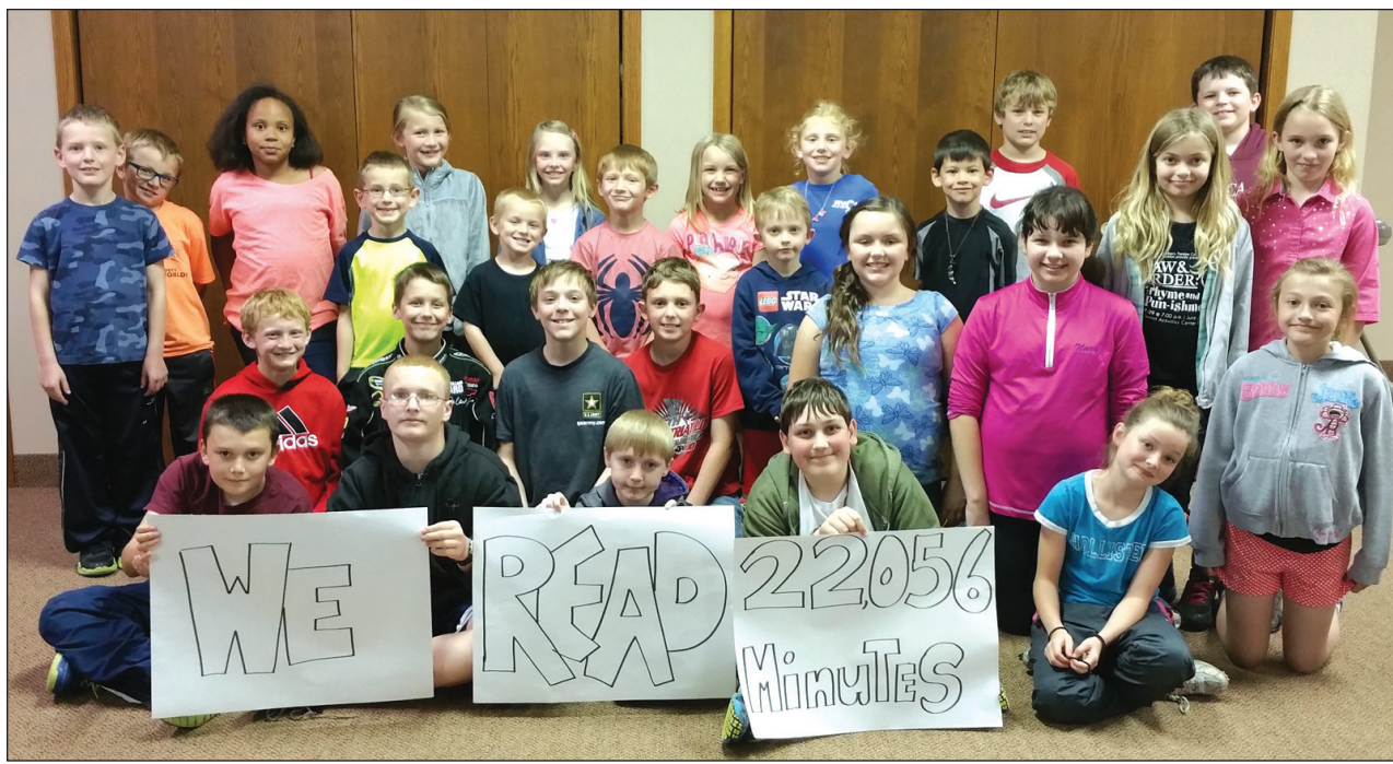
The students of Missouri Valley Christian Academy (Yankton) had a Read-a-Thon in March to raise funds for the school. The 30 students were challenged to read 15,000 minutes from March 1-31. The students smashed that goal and read 22,056 minutes and were treated to their reward this past weekend with a lock-in at the school. Students raised approximately $5,000. For more information about MVCA, visit the website at www.mvcamustangs.org/.