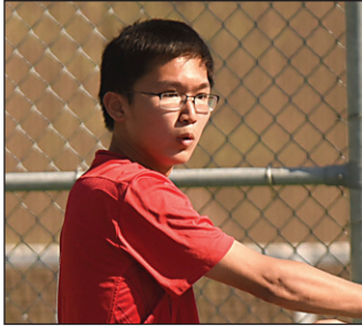
Teams Compete In State Tourney • 6A