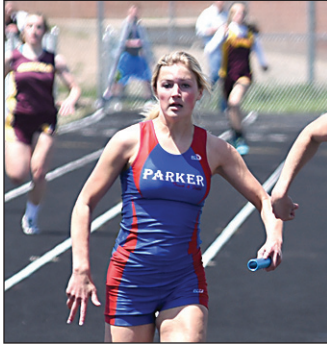
Area Track Teams Vie For State • 6A