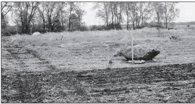
Surveyor’s stakes and huge boulders mark all four corners of the cemetery plat. The closest marks the northwest corner.

The new map shows five adjacent rows with 18 lots in each. According to the 1941 WPA Survey, possibly as many