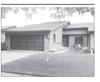
2516 Mulberry $259,000

3-bedroom, 2-1/2 bath townhouse, view of Hillcrest Golf Course. 1-step entry, 3-season porch, vaulted ceiling, gas insert fireplace, pool access. 605-760-7082.