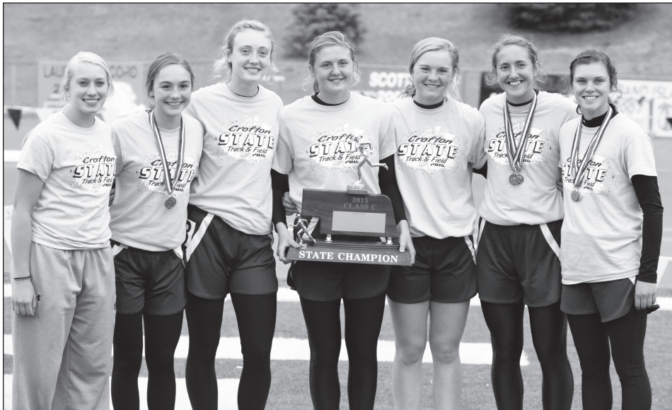
The Crofton girls ran away with the Class C championship at the Nebraska State Track Meet, which concluded Saturday in Omaha. The Lady Warriors were first by 27 points, capturing their second consecutive title.

13 consecutive state track titles from 1996-2011, but won only one state volleyball title (2006) and never sniffed a basketball championship in that span.