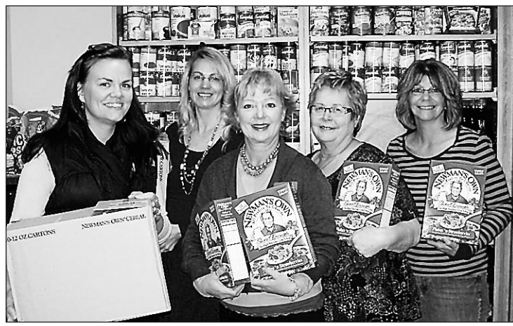
Make A Difference Day was a big success across Yankton, including a special grant received by the United Way for two cases of Newman's Own organic cereal which was donated to the Contact Center.

This year, the Yankton Volunteer Leaders were recognized as national Make A Difference Day honorees by Newman's Own in